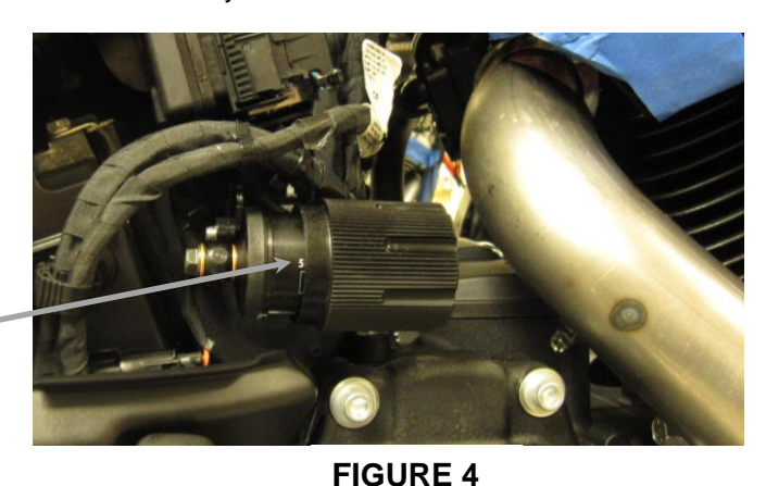
ADJUST KNOB TO #5 SETTING