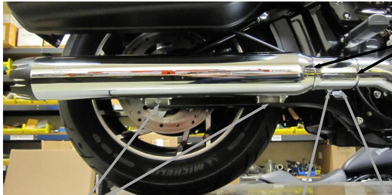
STOCK MOUNTING BOLTS