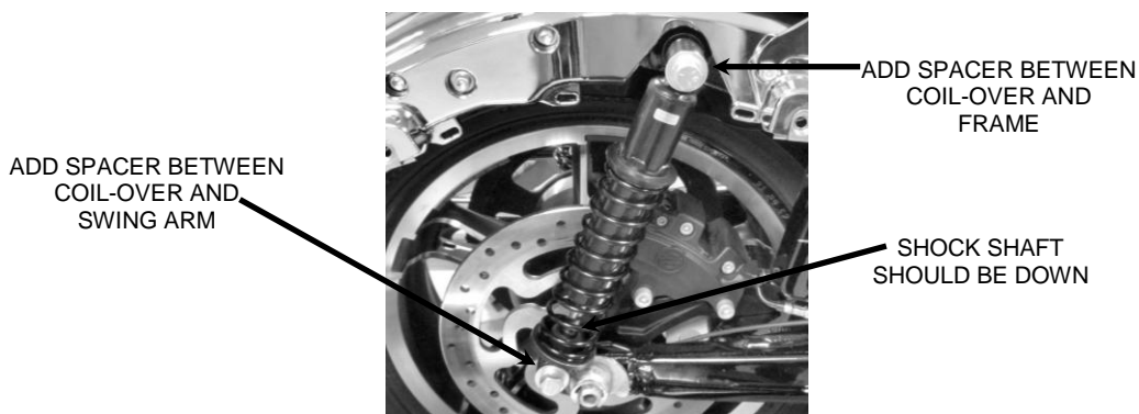
FIGURE 1 ONLY FOR MODELS EQUIPPED WITH COIL-OVER SHOCKS

* Cobra® recommends you always wear a helmet while riding. Please never operate your motorcycle while under the influence of alcohol and/or drugs. Enjoy the new look of your motorcycle and please ride safely.