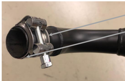
CLAMP ORIENTATION CLAMP FLUSH WITH END OF INLET SLIP PLACE MUFFLER ON SLIP AND ROTATE UP INTO POSITION

DO NOT REMOVE BAFFLE FROM MUFFLER BODY. REMOVING BAFFLE WILL VOID WARRANTY!