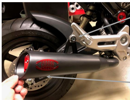
MUFFLER IN POSITION BEHIND EXHAUST / FOOT PEG MOUNT INSTALL STOCK BOLT, WASHER AND NUT. USE BLUE LOCTITE HOLD MUFFLER IN POSITION FOR BOLT INSTALLATION